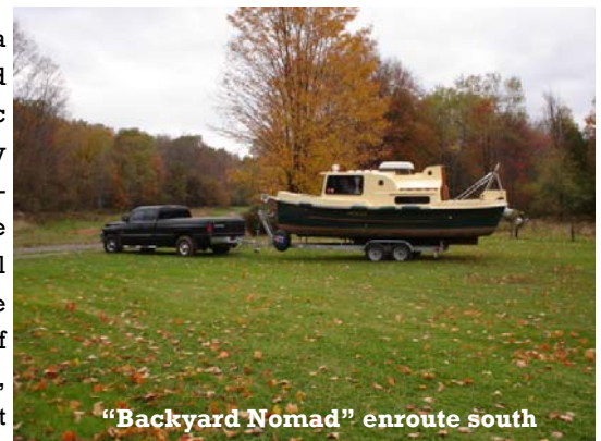
"Backyard Nomad" enroute south

Eastman's favorite town of Rochester, NY. The place fairly crackles with excitement, and boaters lucky enough to be parked along the town wall are in the midst of all the fun! In fact, the venue is so fine that many of our customers plan to spend a couple of nights here before turning the boat around and heading back for Brewerton on their personal cruise adventures