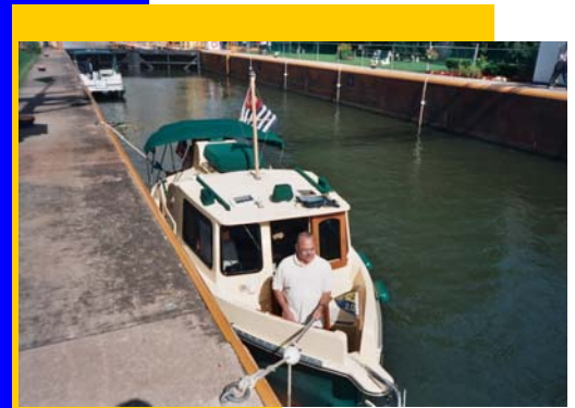
Nomad clearing Lock 23 near Brewerton

and we thank our cruisers for that tender care!